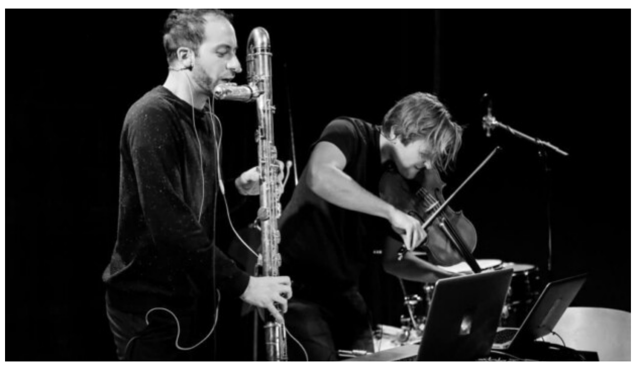
Nimikry Music

July 15, 2020 / contemporary music (https://www.musicexport.at/category/contemporary-music/), jazz/improvisation (https://www.musicexport.at/category/jazzimprovisation/), music business (https://www.musicexport.at/category/music-business/), news (https://www.musicexport.at/category/news/), portraits/interviews (https://www.musicexport.at/category/portraitsinterviews/)